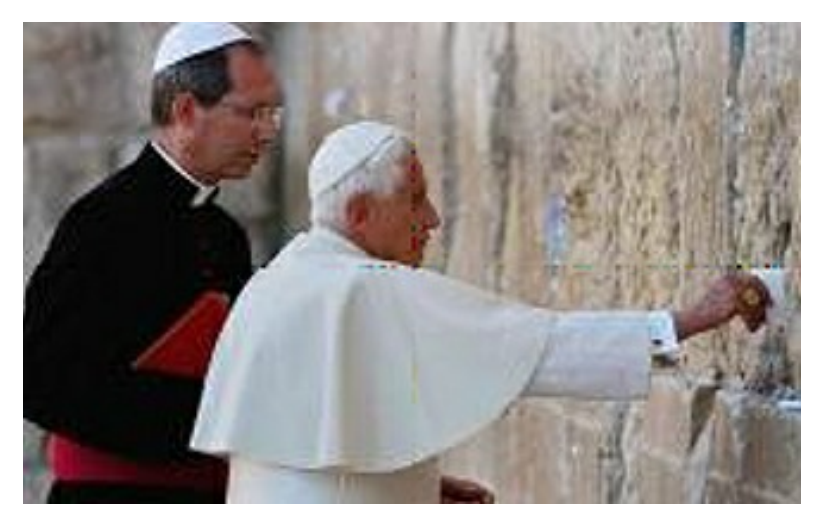
Pope Benedict XVI places his note to God in the Western Wall at Judaism's holiest site in Jerusalem's Old City, Israel.

The muddle overshadowed the second day of the Pope's visit to Israel and the occupied Palestinian territories, when he visited sacred sites around Jerusalem and sought to bridge the historic divide between Catholicism and Judaism.