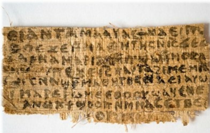
The ancient papyrus that was said to prove that Jesus was married to Mary Magdalene