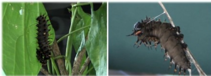
Above Left- Eating his own skin. Above Right - Spinning The Cremasta.

Our ugly caterpillar, (Cairns Birdwing) lives and grows on a vine found in the north Queensland rain forests, (Aristolochia) common name, Dutchman Pipe. The sap again is very poisonous. Although caterpillars can eat these plants, any bird or spider trying to make a meal of them will end up the worst off. Not until the chrysalis stage do we find a predator. Once again, who told this parent butterfly to lay her egg on those special host plants? Did they just happen to find this out. Might I present to you again another of God's invisible works of creation. Whilst we know it happens we also know that only a great Creator could speak and this would happen. Blesses my heart to observe these things by faith, created by a wonderful God.