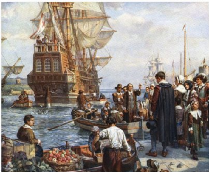
Pilgrim Fathers Boarding The Mayflower

For two months, 102 people were wedged into what was called the “tween decks” of the Mayflower—the ship’s cargo space with only about five-and-a-half feet of headroom. No one was allowed above deck because of the terrible storms. This was no pleasure trip. The Pilgrims comforted themselves on their journey by singing from the Book of Psalms. This “noise” irritated one of the ship’s paid crew members. He told the Pilgrims he was looking forward to throwing their corpses overboard after they succumbed to the routine illnesses common on such voyages. As it turned out, this crew member himself was the only person to